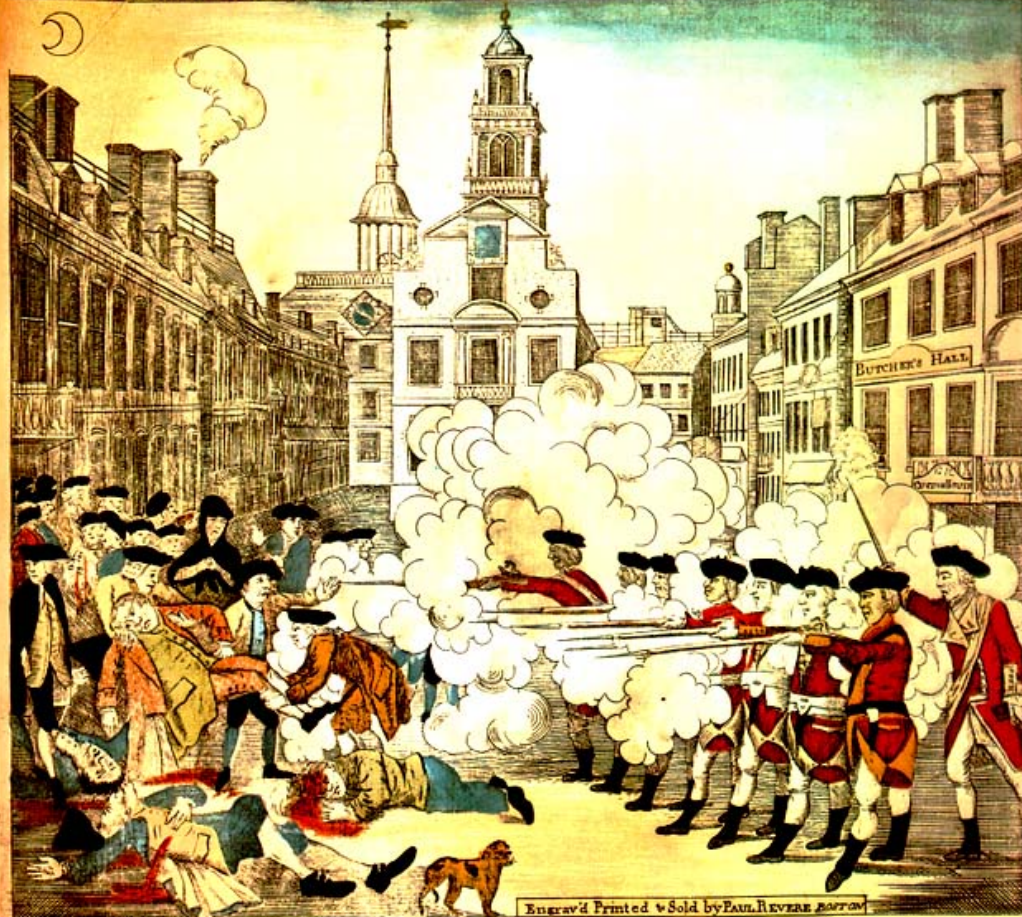
Engraved Printed & Sold by PAUL REVERE BOSTON

Unhappy Boston! see thy Sons deplore, Thy hallow'd Walks besmear'd with guiltless Gore: While faithless P—n and his savage Bands, With murderous Rancour stretch their bloody Hands; Like fierce Barbarians grinning o'er their Prey, Approve the Carnage, and enjoy the Day.